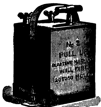
SEND FOR CATALOGUE.