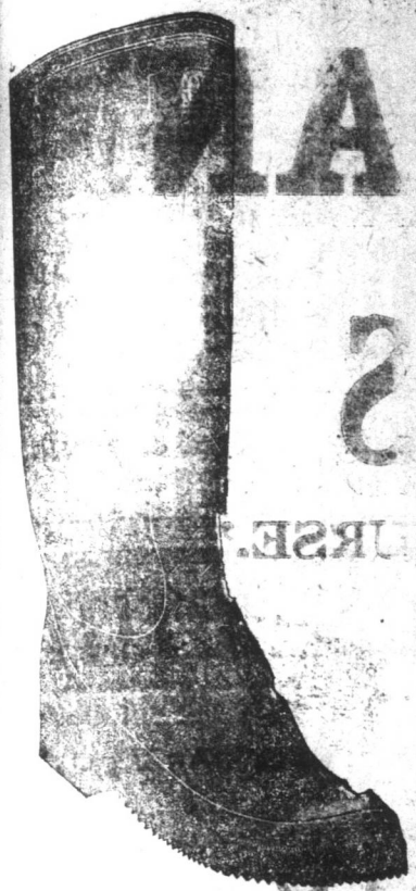
"EXCEL" Made 'All in One Piece'