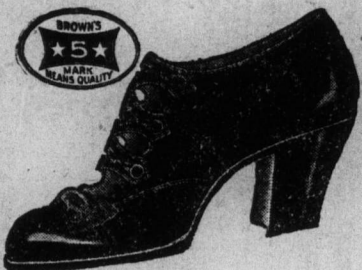
WHITE HOUSE SHOE FOR WOMEN

Low Shoes will be worn more this year than ever before. We have the Shoes, the correct models, and the prices, too.