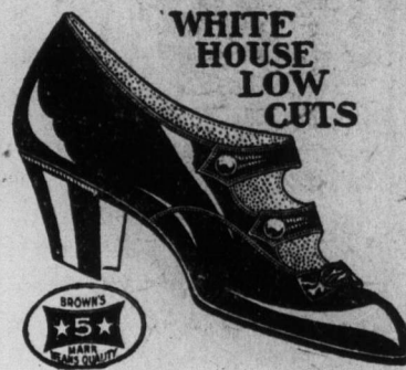
WHITE HOUSE LOW CUTS