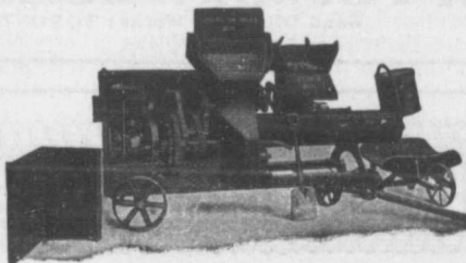
Furnished with Steam, Gasoline or Electric Power.

The Eureka Concrete Mixer is adaptable to all kinds and classes of work. Easily moved and ready for work instantly when on the job. The measuring is automatic and guaranteed accurate and reliable.