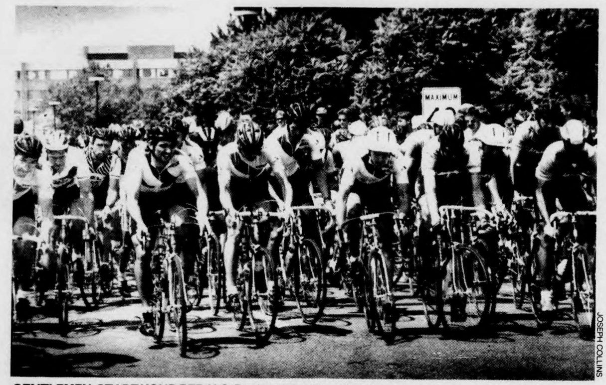
GENTLEMEN, START YOUR PEDALS: Participants at the Miele Club amateur race, held on York campus last weekend, begin their arduous journey around York and environs.