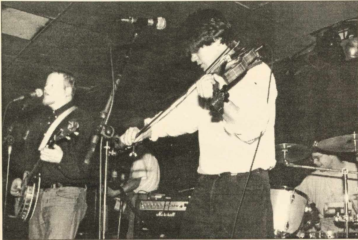
Uisce Beatha's celtic sounds packed 'em in at the Deuce.