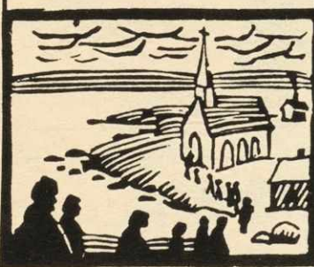
hurch Scene, Africville 1949

Entertainment: A celebration concert, The Spirit of Africville, including the church choir The Gospel Heirs, the a capella group Four the Moment, and dramatized readings of plays and poetry arising from the Africville experience will be performed tonight at 8 at MSVU. For any further info call 443-4450.