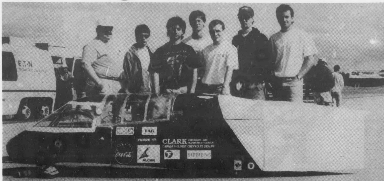
Last year's team and UNB's ninth place vehicle in Michigan.