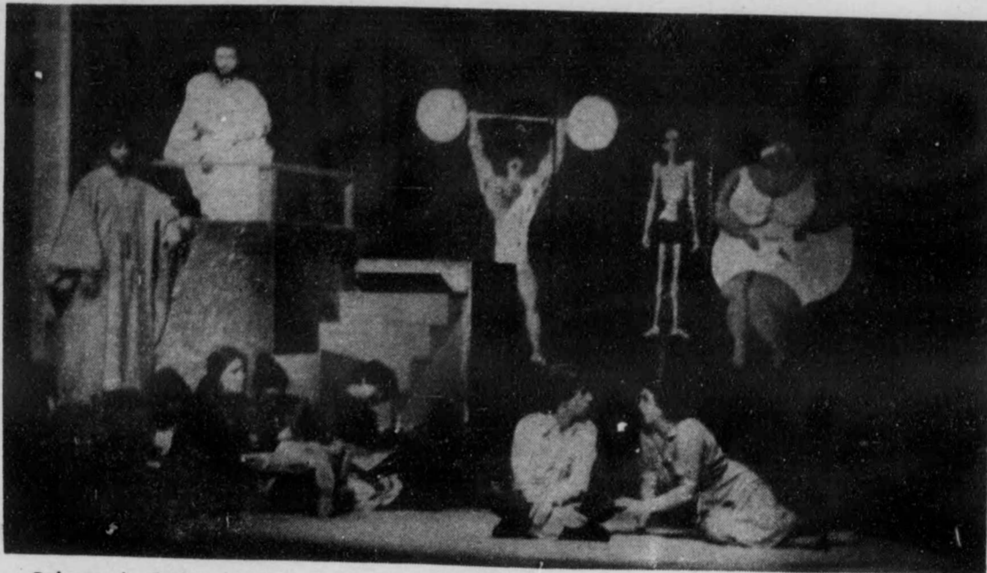
Rehearsal of the play JB to be presented this weekend.

The d'Avray Hall Noon Time Series is supported by the creative arts committee of UNB and STU and the New Brunswick cultural development branch of the department of youth, recreation and cultural resources.