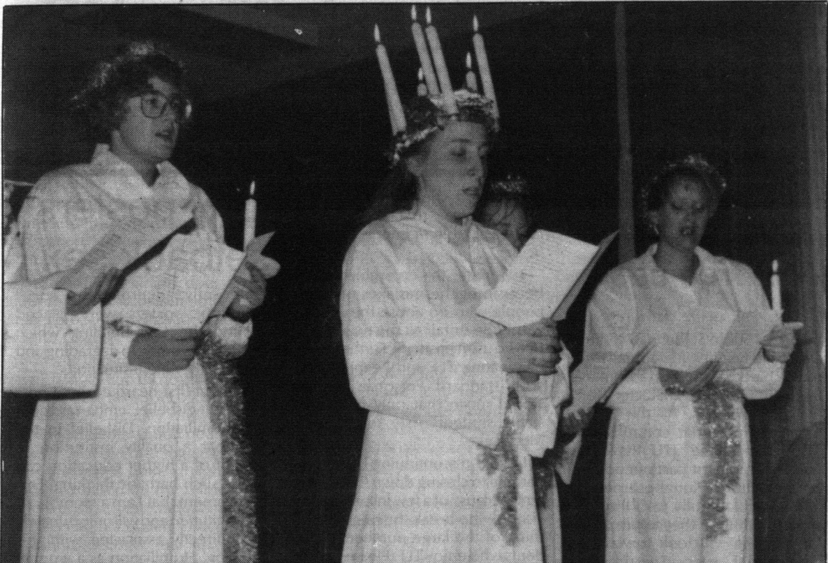
Nu är det jul igen

Fisher also received word last week from the Planning and Development department that no construction would occur during the December 6 to 16 period.