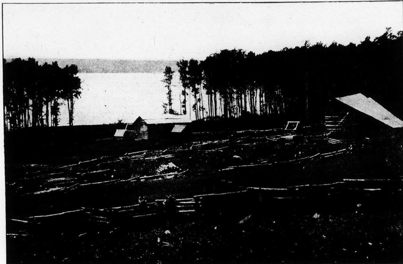
Pioneering on the Shores of Snake Lake, Alta.