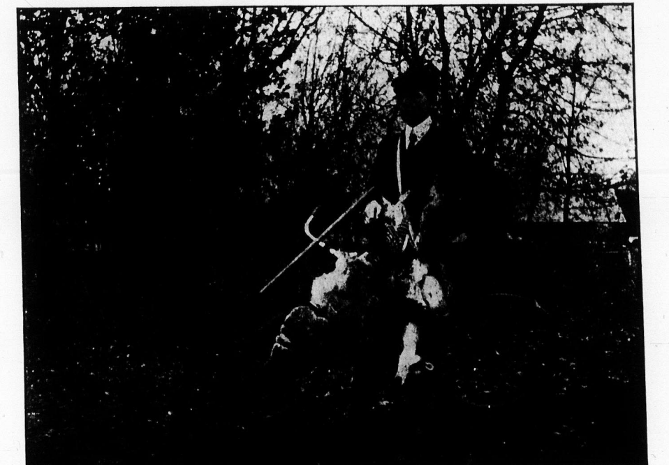
Just returning from an hour's Sport, Neepawa, Man.