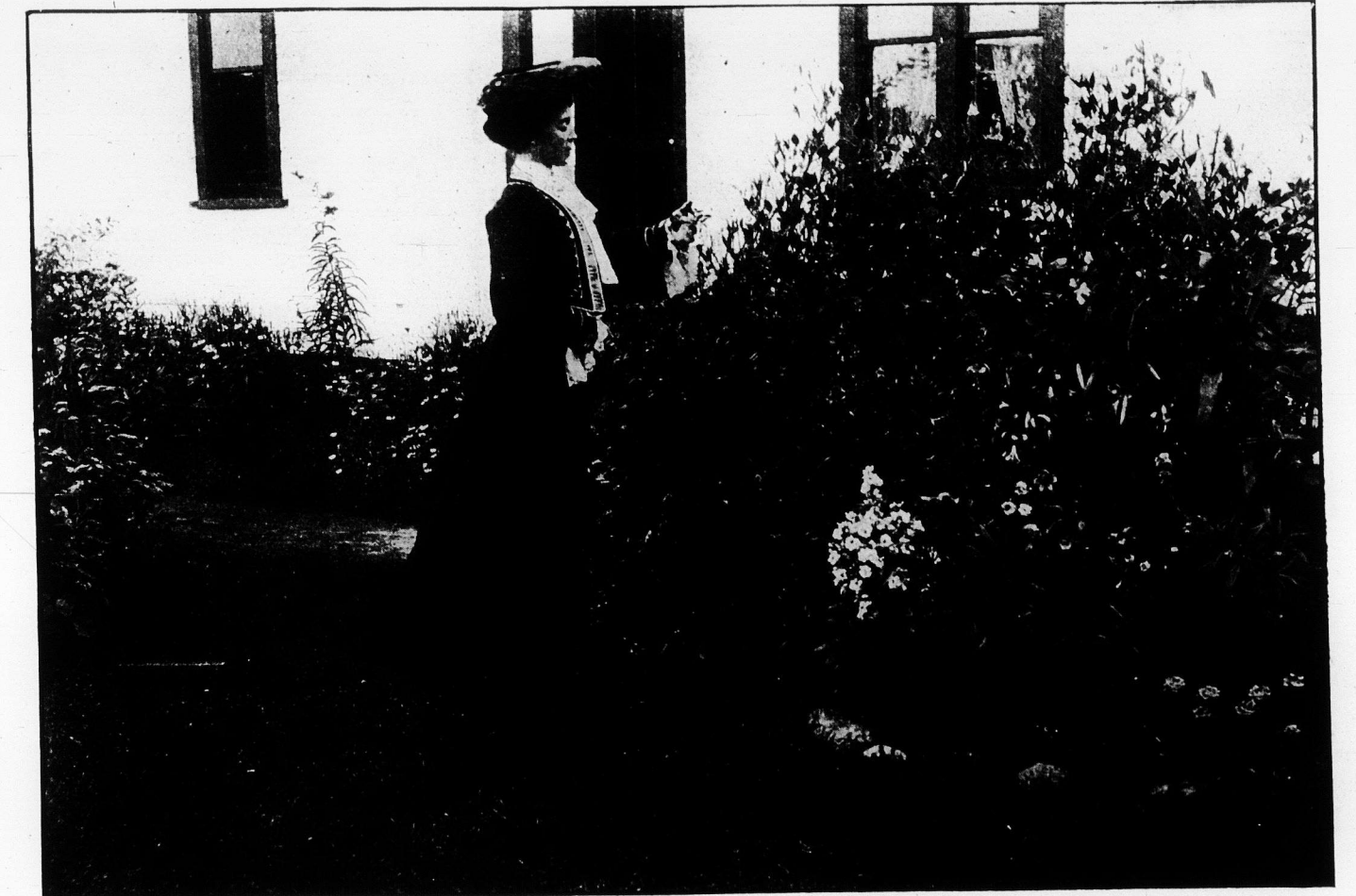
An August Garden at Pilot Mound, Man.