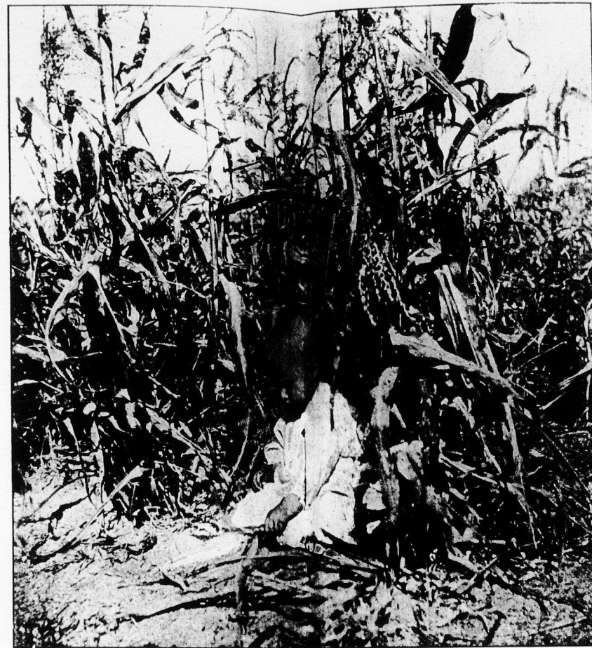
Corn growing at Lethbridge without irrigation.