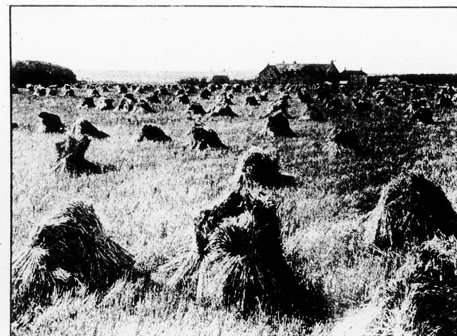
Wheat field at the Crowstand Indian Boarding School, Saskatoon, Sask.