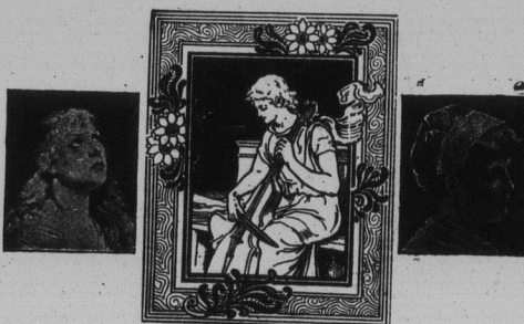
Any of the above pictures in sizes to suit purchasers.

An interesting and decidedly useful album may be made by following the progress of building from the early Egyptians to the present time, including the Greek, Roman, Renaissance, Gothic and Modern styles, interspersing the famous marble buildings of India and the curious temples of Japan.