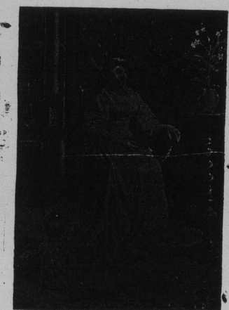
And of the above pictures in sizes to suit purchasers.

If so, make up an album of your favorite authors. Use first the portrait of an author, then his home if obtainable, and let these be followed by illustrations of his works. Scott, Shakespeare, Burns, Dickens, and many others may be treated in this way, making a most interesting collection. We also publish full sets of illustration for books on art and travel, such as "The Marble Faun," "Ben Hur," "Rymols," "Corinne," Grimm's "Life of Michael Angelo," Taine's "Italy," and a host of others.