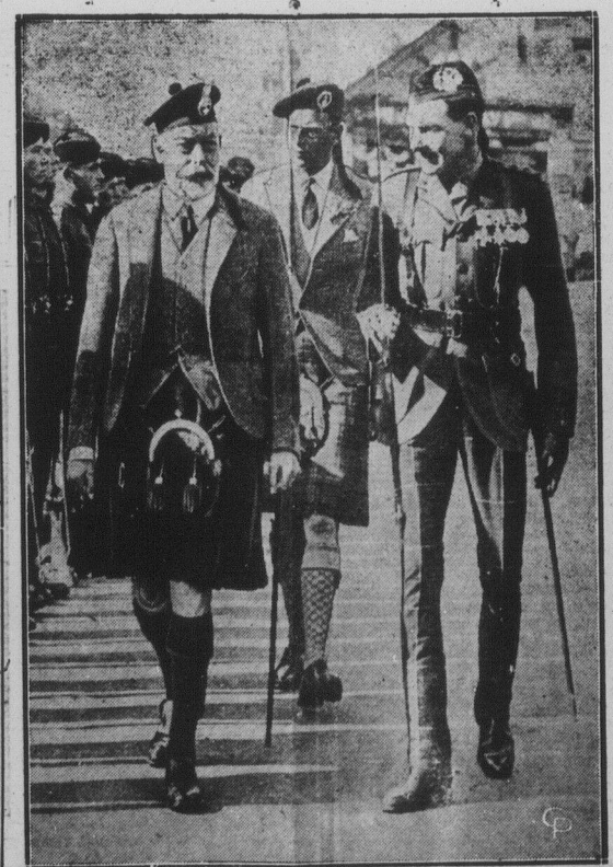
King George arrived at Ballater, Scotland, recently on his way to Balmoral castle for his annual Scottish holiday.