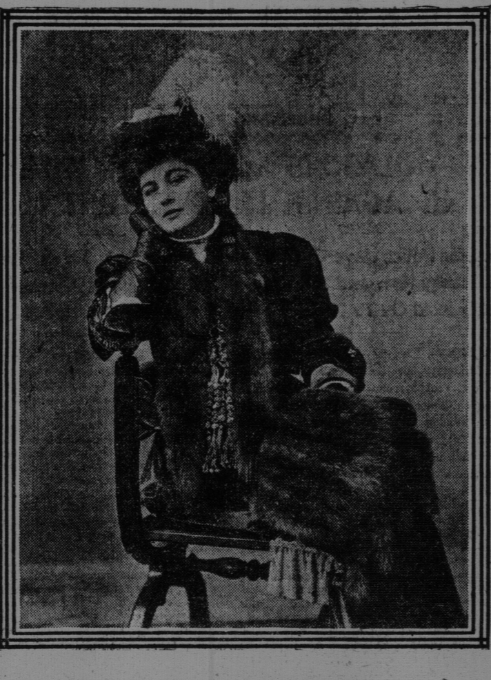
MATCHING SCARF, MUFF AND HAT OF MINK.

The most noticeable thing in furs at the home show this winter was the neck scarf made of two skins, the heads crossed or laid flat side by side over the shoulders, the tailed bodies hanging straight over the coat fronts.