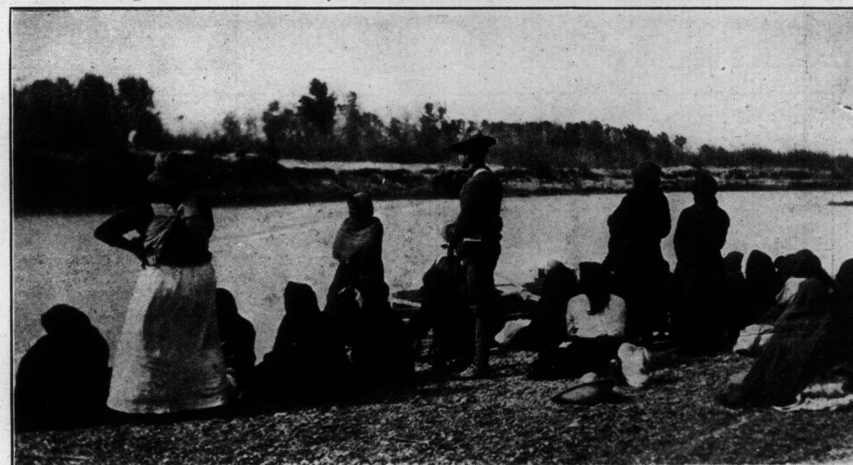
The first photograph received from Presidio, Texas, where Mexican refugees crossed the Rio Grande, shown here, after the battle at Ojinaga had raged for two days and made it impossible for women and children to remain where there was neither food or shelter. Two thousand refugees took shelter in this way, and sentries were placed on guard, with the order to return fire should the Mexicans fire on the refugees, who had been disarmed.