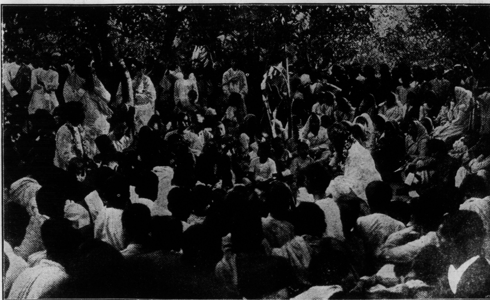
NOT WITHOUT HONOR IN HIS OWN COUNTRY. "THE PROPHET OF INDIAN NATIONALISM, AND RECIPIENT OF THE 1913 NOBEL PRIZE FOR LITERATURE, HONORED IN BENGAL. RABINDRANATH TAGORE RECEIVING AN ADDRESS.