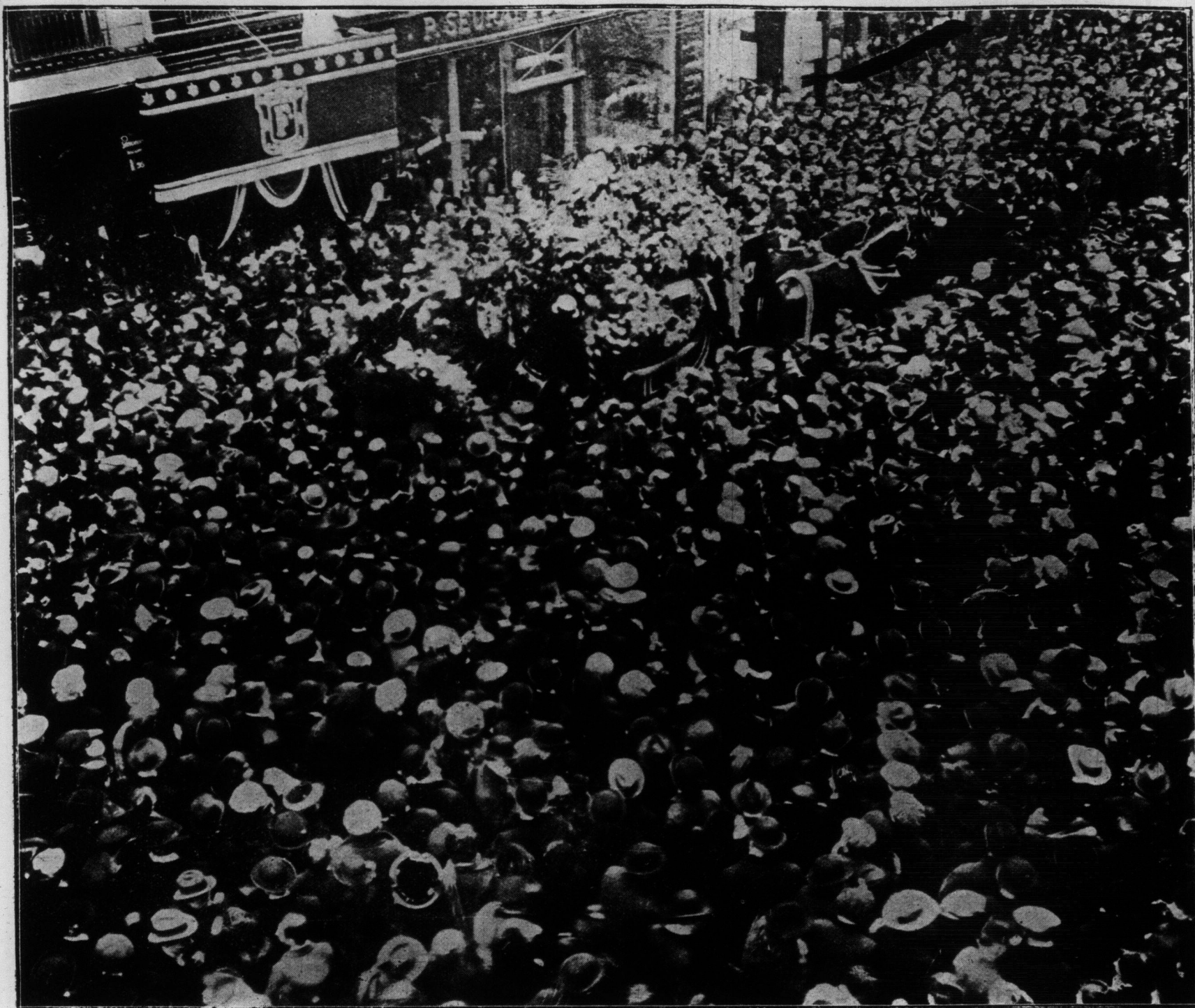
ALMOST A RIOT AT FUNERAL OF FAMOUS ACTOR MURDERED BY HIS FATHER. THE GREATEST OUTPOURING OF HUMANITY EVER SEEN AT THE FUNERAL OF A PRIVATE PERSON IN PARIS, JAMMED ITSELF INTO THE NARROW CONFINES OF THE STREET IN FRONT OF THE HOUSE OF HENRY FRAGON. BECAUSE OF THE INABILITY OF THE POLICE TO COPE WITH THE CROWD, WHAT WAS MEANT TO BE A GREAT TRIBUTE, ALMOST DEGENERATED INTO A RIOT.