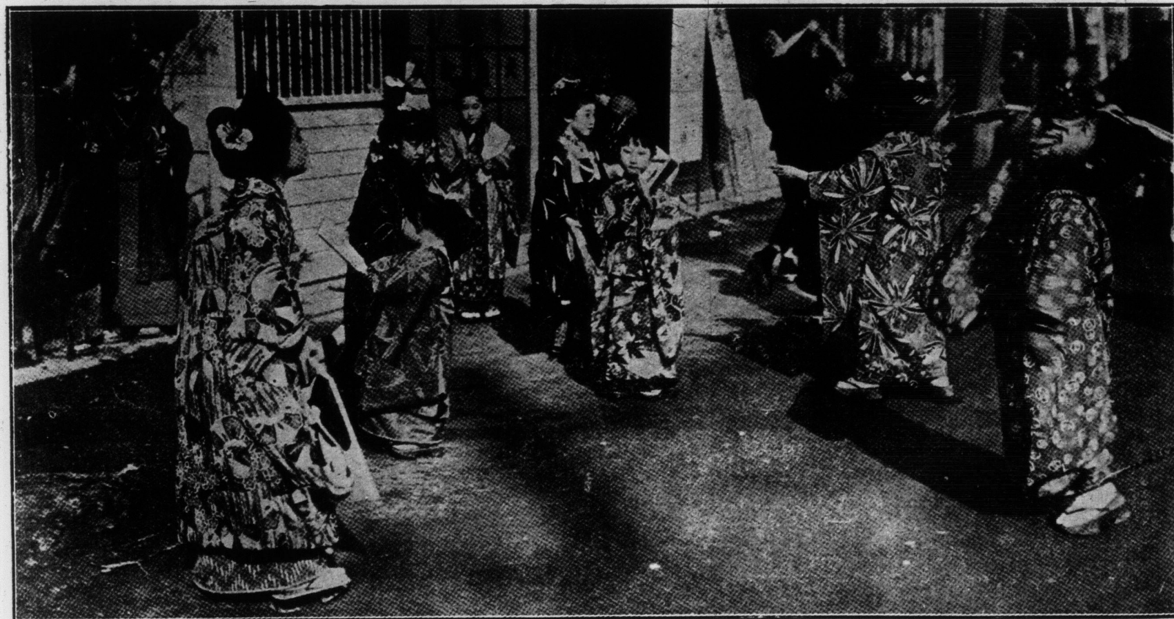
A GAY LITTLE SCENE FROM FLOWERY JAPAN. ON NEW YEAR'S DAY LITTLE GIRLS GO OUT IN TOKIO STREETS CLAD IN THEIR MOST BRILLIANT KIMONOS AND PLAY BATTLEDORE AND SHUTTLECOCK.