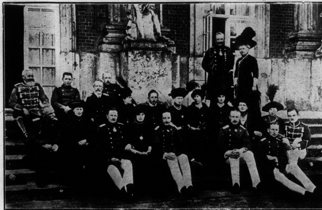
This snapshot of the family of the Kaiser and Kaiserin of Germany, was made on Christmas Day, in front of the new palace at Potsdam. The group contains the Kaiser's son-in-law, his daughters-in-law, the Kaiser's brother, three sisters, brothers-in-law, sister-in-law and nephew. The Kaiser and Kaiserin are standing.