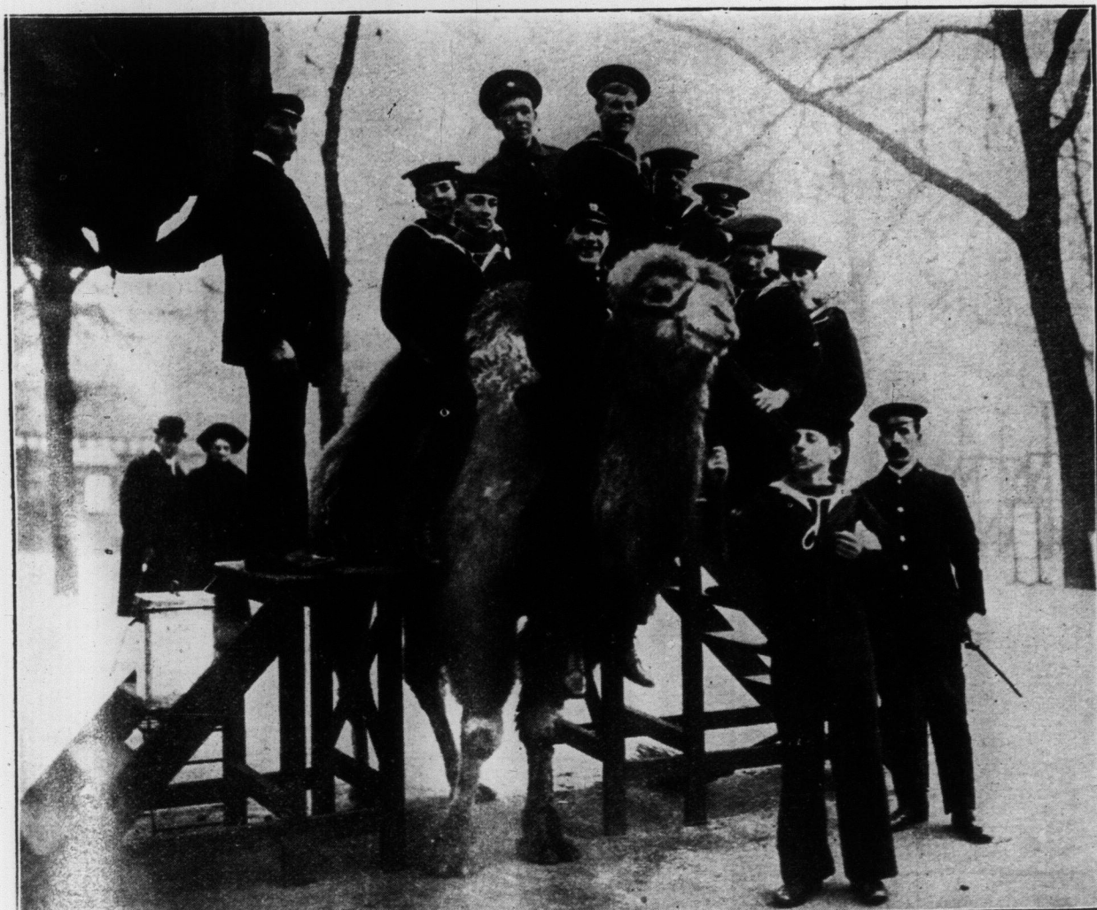
LEARNING TO MANAGE THE SHIP OF THE DESERT. A PARTY OF SAILORS IN THE MAKING TAKING A DAY OFF IN THE LONDON ZOO AND LEARNING TO RIDE THE CAMEL.