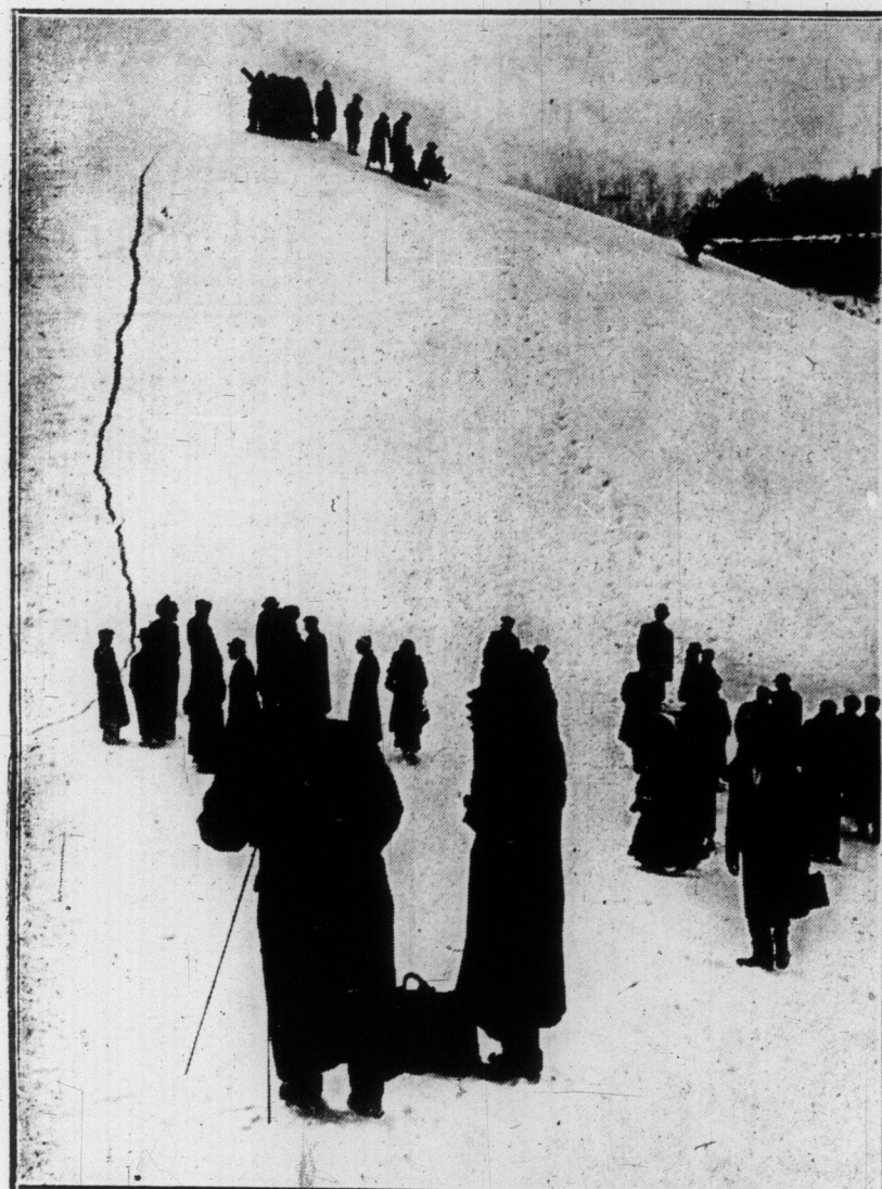
NIAGARA IN WINTER. THE GREAT ICE MOUND FORMED BY THE SPRAY OF THE AMERICAN FALLS.