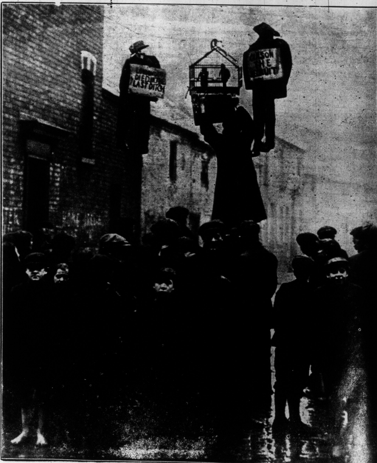
IN THE NATIONALIST OR CATHOLIC SECTION OF BELFAST, LORD LONDONDERRY AND SIR EDWARD CARSON WERE BURNED IN EFFIGY ON THE DAY OF THE CHURCHILL HOUSE RULE MEETING.