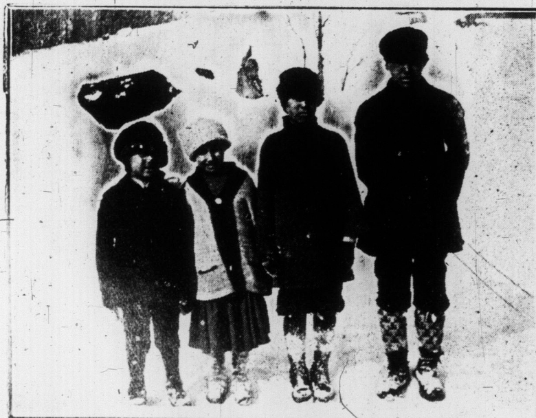
INDIAN CHILDREN ON PARRY ISLAND.