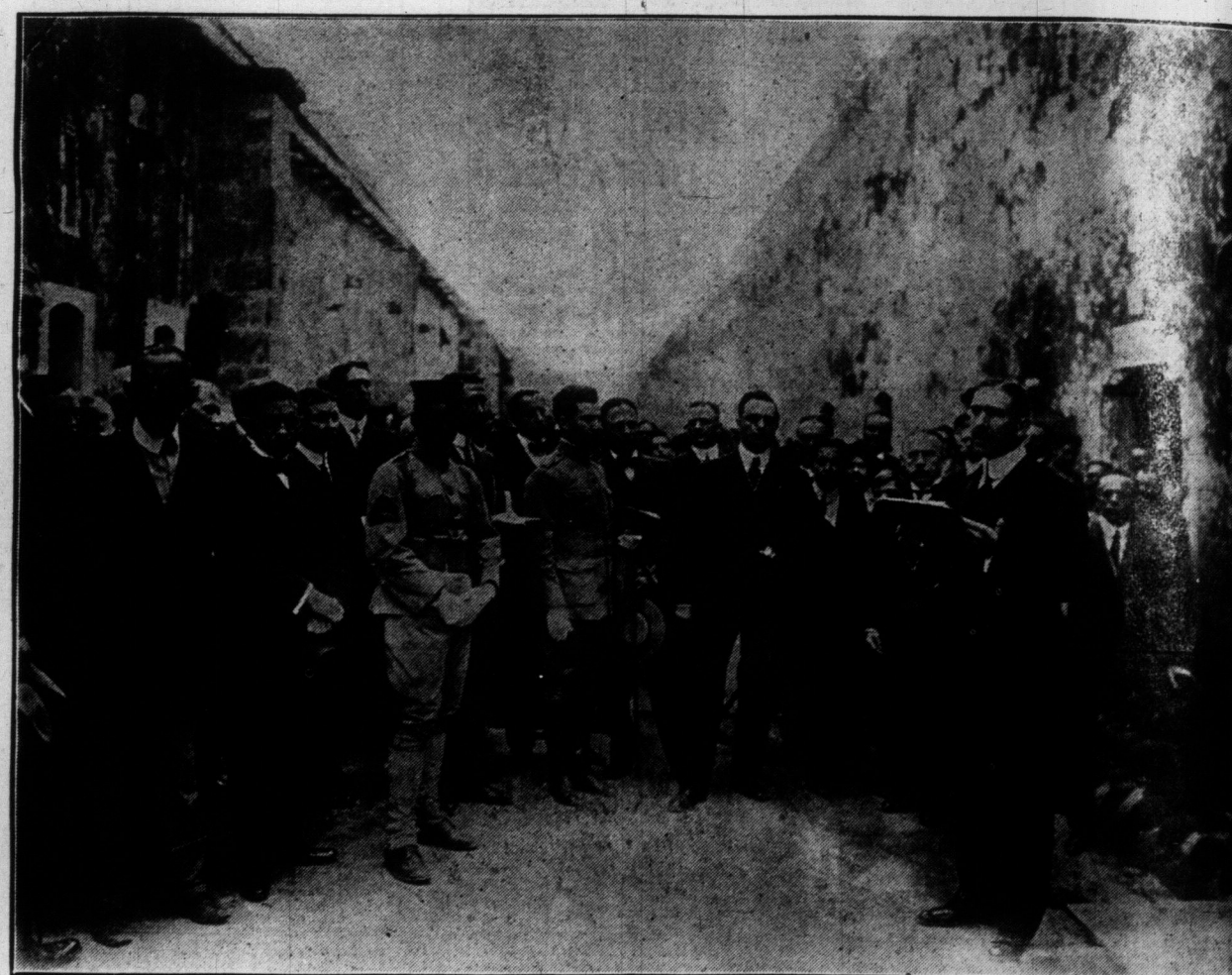
AMERICAN MINISTER TO CUBA READING THE BURIAL SERVICE OVER THE BODIES RECENTLY RECOVERED FROM THE BATTLESHIP MAINE.