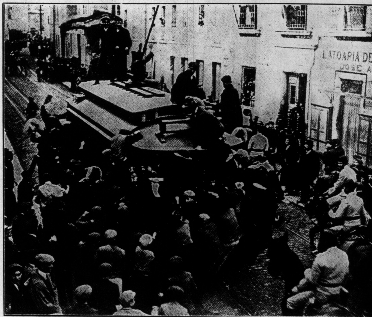
STRIKERS IN POSSESSION OF A STREET CAR IN LISBON.