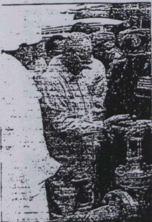
Turabi, Nimeiri and Bashir turn on the oil May 1999

May 99: Ministers say Sudan will be self-sufficient in oil production by mid-1999 and be able "to export crude oil for the first time ever in the second semester of 1999. Initially we hope to export 150,000 barrels of crude oil per day which would be increased to 250,000 b/d in the year 2000" - Awad al-Jaz