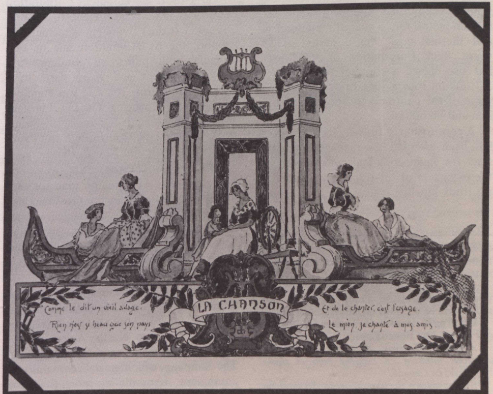
Drawing by Jean-Baptiste Lagassé of a float for a parade.

One highlight of the exhibition is a presentation of photographs from 1928 documenting the Saint-Jean-Baptiste Parade of that year, when the theme of each float centered around one specific song.