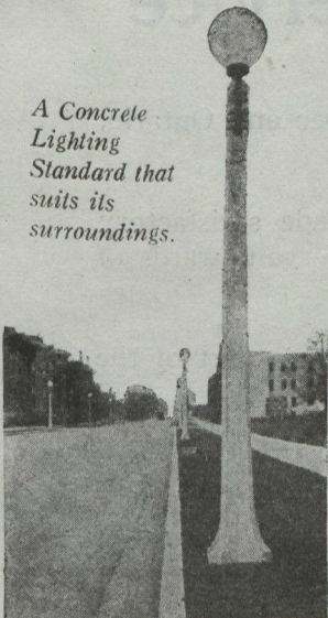
A Concrete Lighting Standard that suits its surroundings.

But for this and other similar requirements where aesthetic considerations are second only to the practical, still another reason for using Concrete is found in its adaptability. It may be moulded to any design that best suits the neighborhood in which it is to be placed.