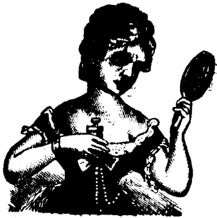
A skin of beauty is a joy forever.