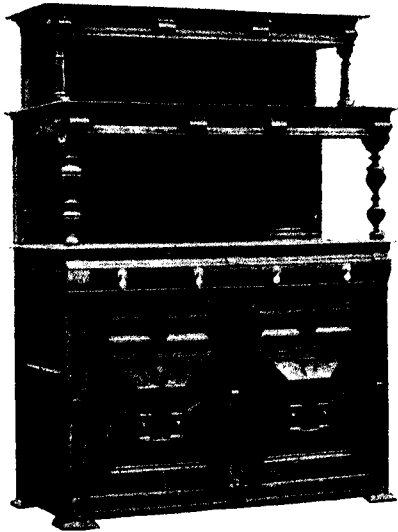
A 17th Century Welsh Cupboard Flemish Baroque Influence

HIGH CLASS FURNITURE CARPETS DRAPERIES CABINET WORK MADE TO ORDER CLUB and LODGE FURNITURE, ETC.