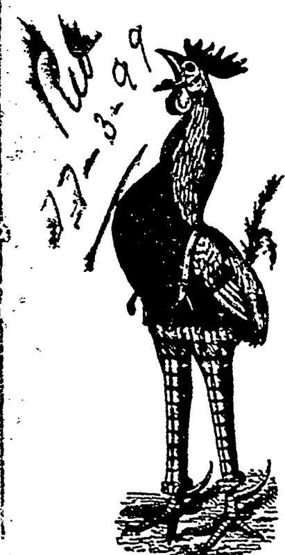
T CROW OVER ALL.