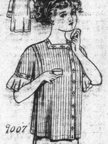
Ladies' Negligee or House Sack. Peasant styles are very adaptable for garments of this kind, and the style here shown embodies grace and comfort. Striped muslin in lavender and white, with white for the ruffles and inserts for a touch of color, was used with good effect. The pattern is cut in 3 sizes: Small, Medium and Large. It requires 3 1/2 yards of 36 inch material for the Medium size. A pattern of this illustration mailed to any address on receipt of 10c. in silver or stamps.