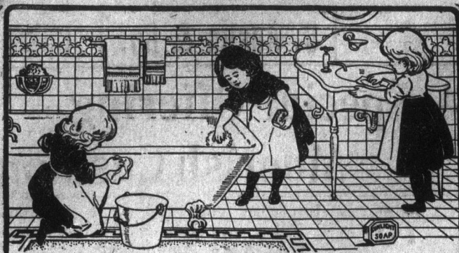
Clean your Homes, Wash your Clothes

You can make every article white and clean with Sunlight Soap. This soap gives better satisfaction than any other soap because it is pure and possesses a cleansing power that ordinary laundry soap does not and can not.