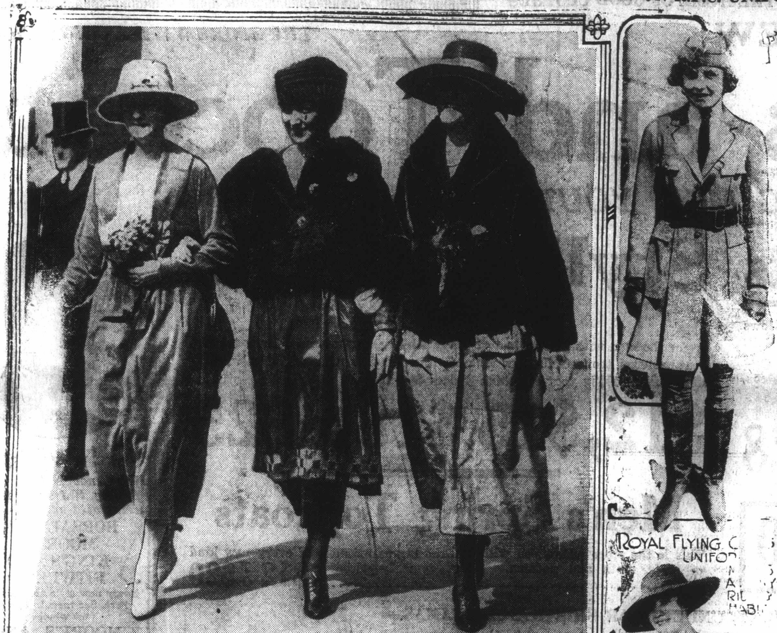
CORDUROY SEEN WITH FIFTH AVENUE'S BEST.

SMART COSTUMES SEEN ON FIFTH AVE., NEW YORK—RIDING SUIT MODELED ON R.F.C. UNIFORM.