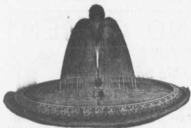
Design No. 1007.

Very Neat and Artistic For Man and Beast.