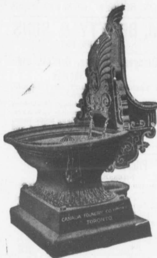
Design No. 1010.

Very Neat and Artistic For Man and Beast.