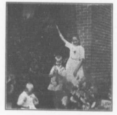
"These Flowers are Mine"

One labor-saver that comes to our minds at this season of the year, and for use more particularly during the summer months, is the fireless cooker. While this convenience is becoming