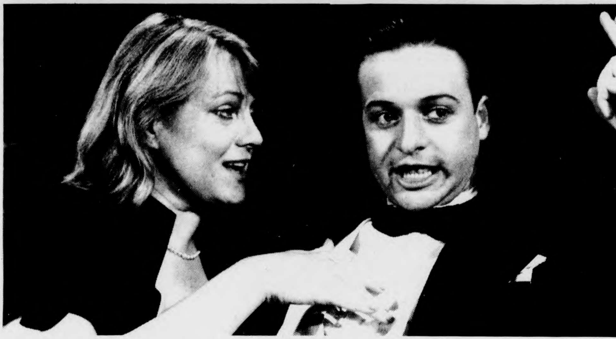
BAWDY JOKES, SOCIAL SATIRE AND FUN: Decadence is for those exploring the seven deadly sins.

What makes Decadence so fascinating is its constant use of irony. The play is written in the language of the people it is trying to parody, which is common enough, but the intricate diction shows that the script is aimed toward an audience of well-educated, affluent types — the exact target of the play.