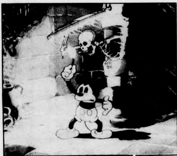
The Divine Mick in The Mad Doctor (1933).