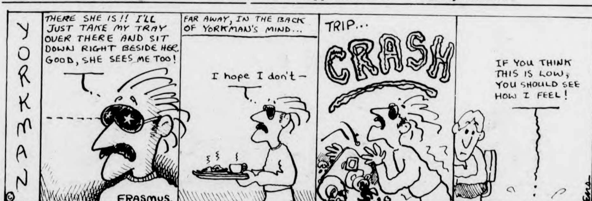
October 2, 198l Excallbur 3