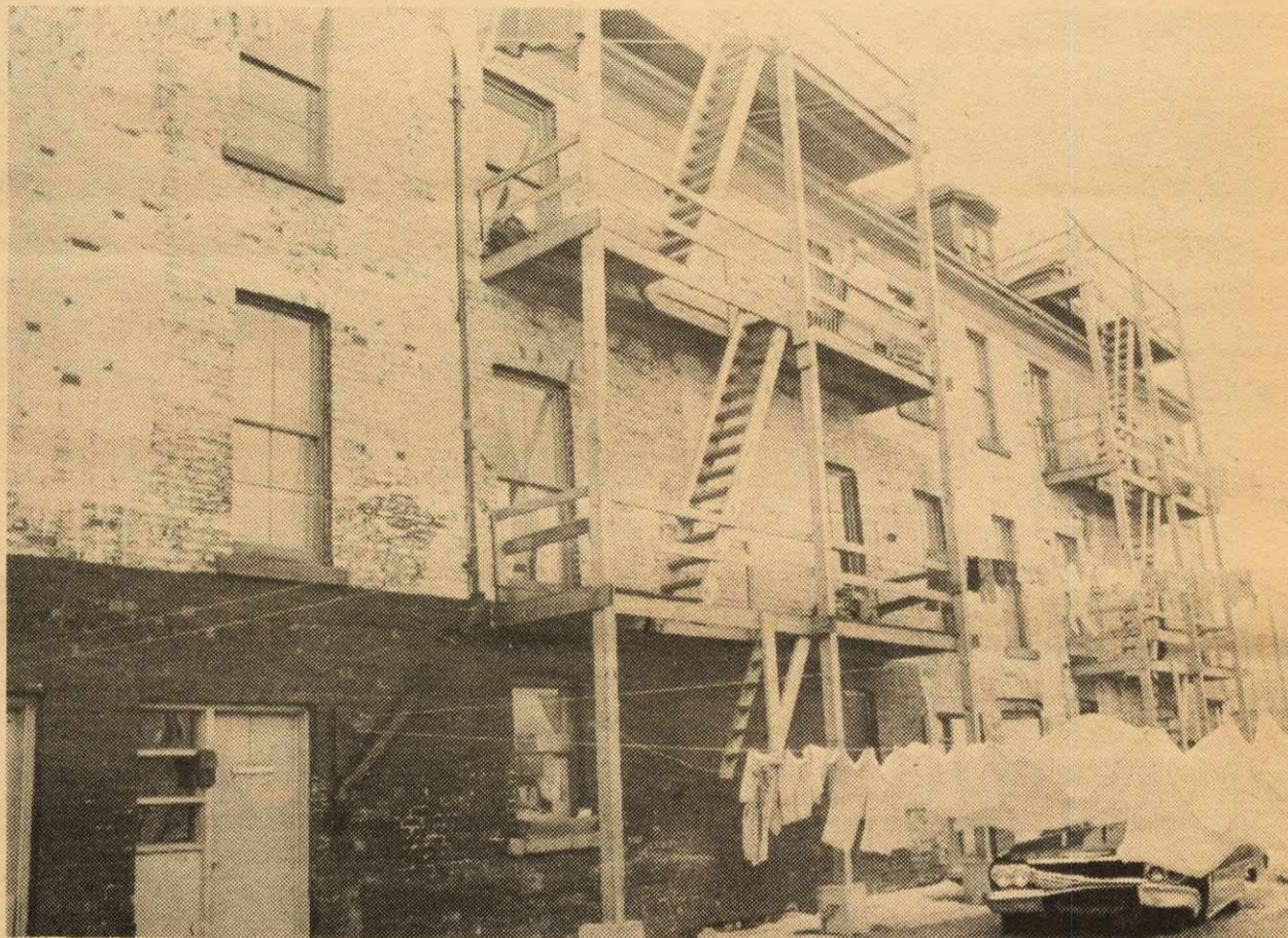
The city is schizophrenic

He could go into Public Housing (if there was a unit empty) But he then becomes "a second class