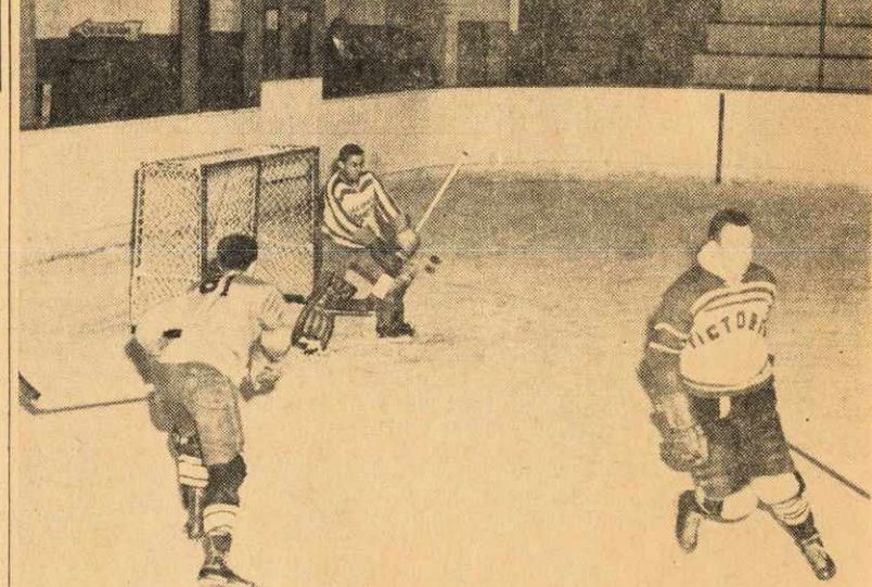
Hockey team starts practice in preparation of early December outing against Acadia.