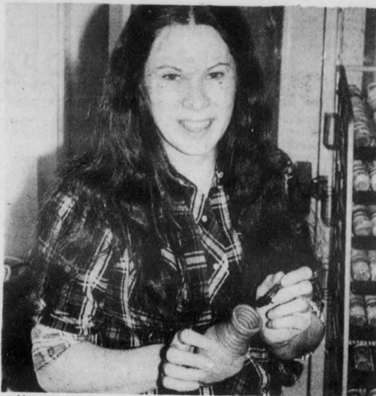
Vocational education students have more fun! Well, they at least get a break from hours every day sitting at a desk with a book, as this young woman is doing in ceramics. If you'd like to know what else is going on in vocational education, stop into Marshall d'Avray Hall for Open House '78, noon-8 p.m. Friday, and 11 a.m. - 3 p.m. Saturday (Mar 10 & 11).