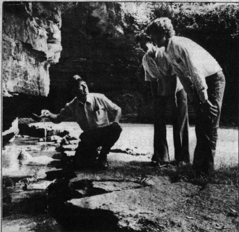
Jack Daniel Distillery Named a National Historic Place by the United States Government

Shared Accommodation: fully furnished luxury 2-storey condo, fireplace, washer/dryer, 1 1/2 baths avail. Jan. 1/84. Rent $420.00/mth - utilities included. 2 blocks from U of A. Phone 433-8222 after 6 pm.