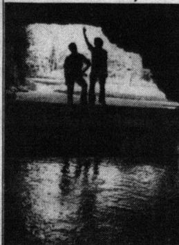
Iron-free, from an underground spring

AT THE JACK DANIEL DISTILLERY , you can taste for yourself why our whiskey is so uncommonly smooth.