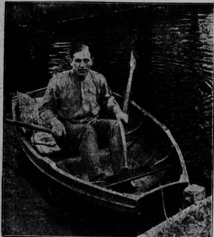
Georges Carpentier, paddling for exercise in a little boat at his retreat near Somersham, Maidenhead, England, during his training for his bout with Lewis, which he won last week.