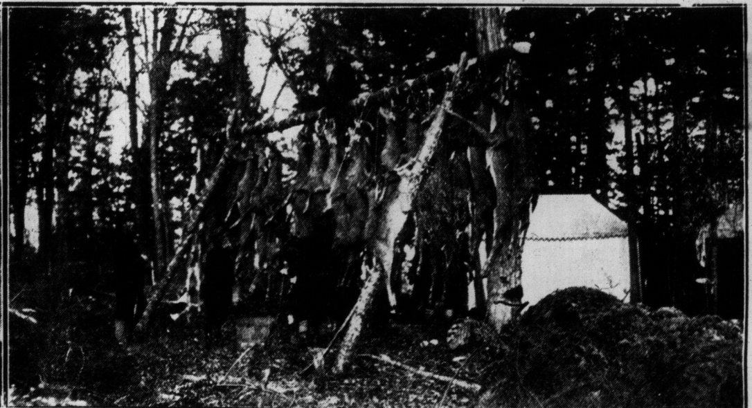
HUNTING SCENES IN NORTHERN ONTARIO.