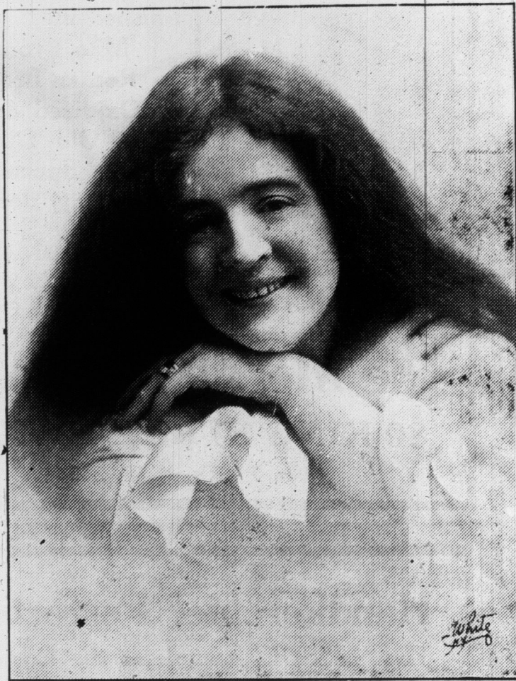
DELLA CLARKE AUTHORESS, WHO WILL BE SEEN IN THE ROLE OF "NEAMATA." THE WHITE SQUAW.