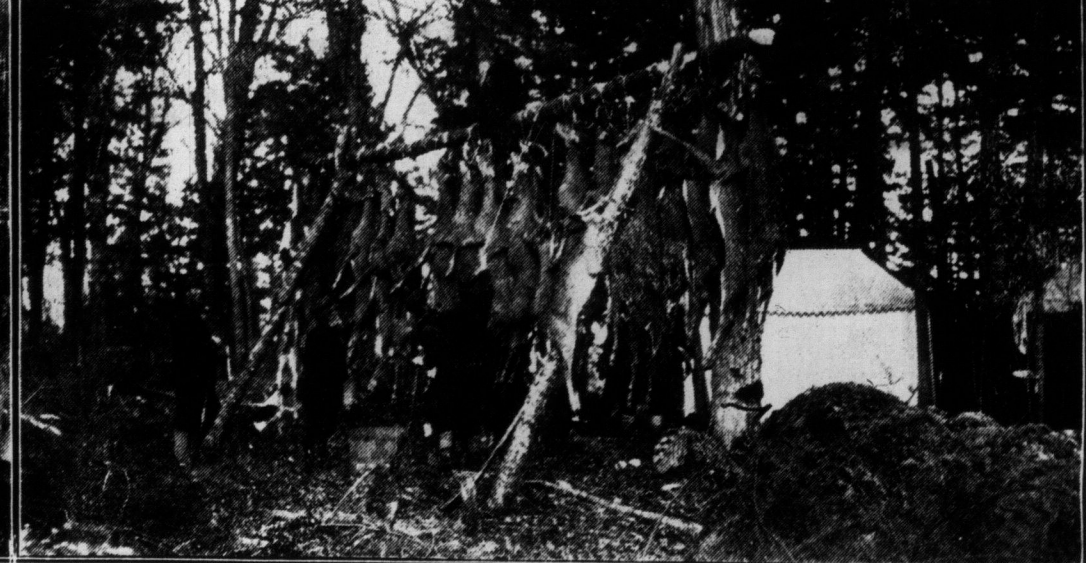
ON LEFT: AT BOLGER, NORTH OF PARRY SOUND, ON THE C.N.O.R. ON RIGHT: CAMP ON THE SOUTH WATER BOLDER