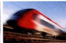
Opening Doors to Europe