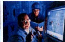
Innovation, Science, and Technology