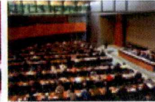
Getting the International Rules Right