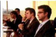
The Anti-Counterfeiting Trade Agreement

Foreign Affairs, Trade and Dev Affaires étrangères, Commerce et Dév