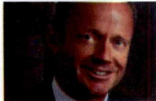
Message from the Minister

Canada's International Market Access Report presents market access achievements from last year and the Department's market access plans and priorities for the coming year. It also outlines foreign market access issues by region and country and provides an overview of Canada's bilateral and multilateral trade policy.