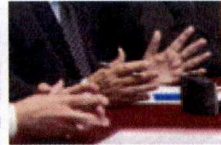
Regional and Bilateral Free Trade Agreements and Other Initiatives