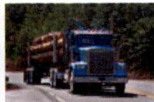
Opening Doors to Asia