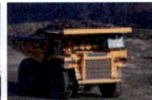
Opening Doors to Latin America and the Caribbean