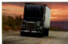
Opening Doors to North America