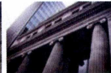
Other Key Markets