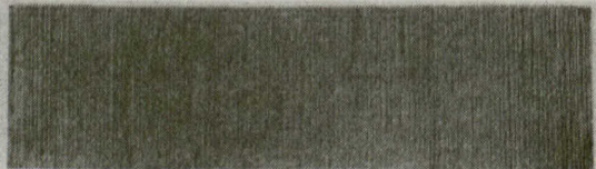
TOOLED FACE BLOCK