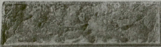
ROCK FACE BLOCK.

When corresponding with advertisers please mention the CANADIAN ARCHITECT AND BUILDER.