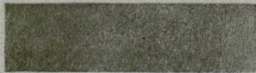
CROSS TOOTH CHISELED