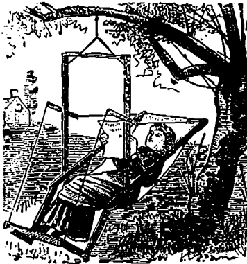
Our Automatic Swing and Hammock Chair

21, 23, 25 and 27 Wellington Street East, 30, 32, 34 and 36 Front Street East, Toronto, and Manchester, England.