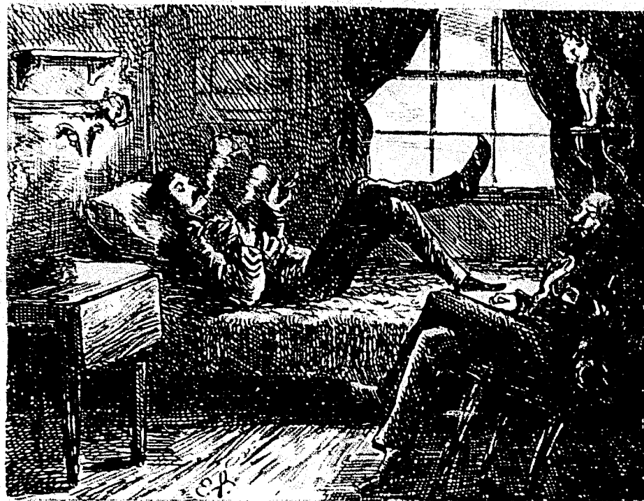
A LAST RESOURCE.

CIVIL FRIEND — "Well, Major, how's things?" SERGT. MAJOR — "Oh! A ruddy dull. No crime, no prisoners, no defaulters, no arrests: to keep my hand in, I'm obliged to SHKEE THE CAT."