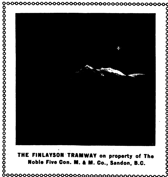
THE FINLAYSON TRAMWAY on property of The Noble Five Con. M. & M. Co., Sandon, B.C.

SILVER-LEAD, COPPER AND PYRITIC SMELTING FURNACES and... FURNACE EQUIPMENTS ROASTING FURNACES and... ORE DRYERS STAMP MILLS DRY CRUSHING MILLS