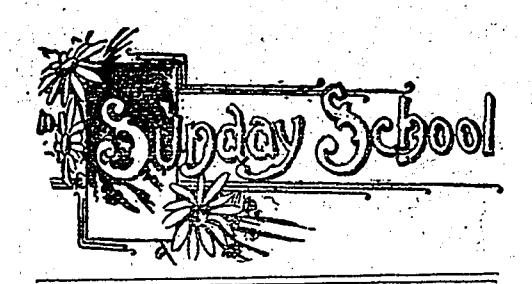
LESSON XIII.—December 30.