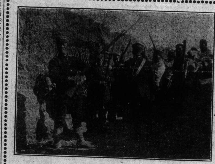
In the Japanese trenches at Port Arthur, within three hundred yards of the Russian position.

The accompanying unique photographs were taken inside the Japanese lines about Port Arthur by a special correspondent of the Colonist, and depict some of the most recent events of the siege.