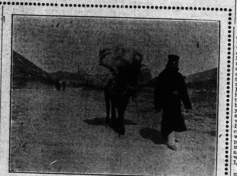
The shell-strewn road. This bit of the Port Arthur main highway is within gun range.