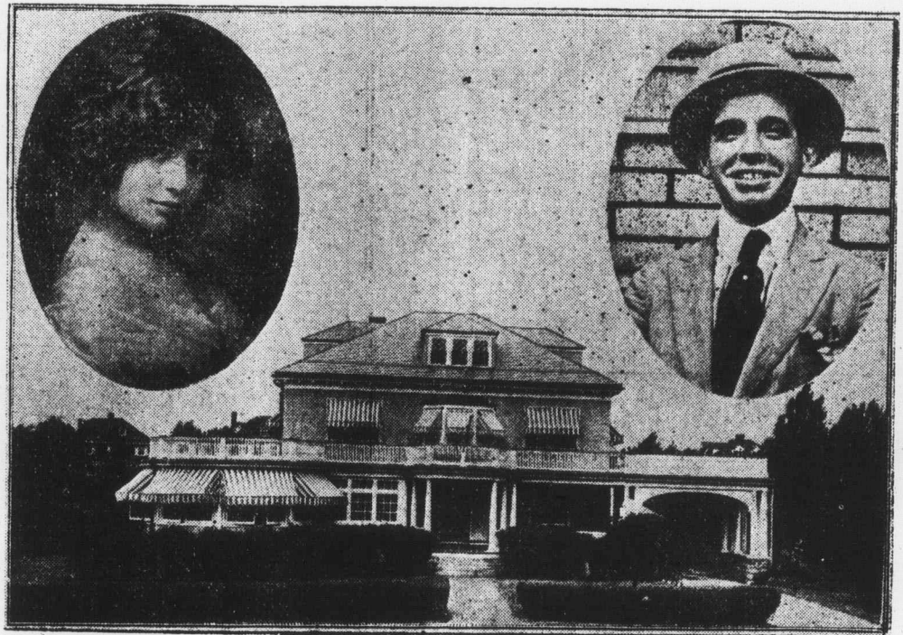
Charles Ponzi, Boston's wizard of finance, who is said to have made close on to $16,000,000 in a few months dealing in foreign exchange (insert) and his wife, Mrs. Rosa Ponzi. The lower photograph shows the beautiful $100,000 home he purchased at Lexington, Mass.