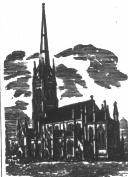
St. James' Cathedral, King St., Toronto, contains 500,000 cubic feet of space and is successfully heated with four of our Economy Heaters.