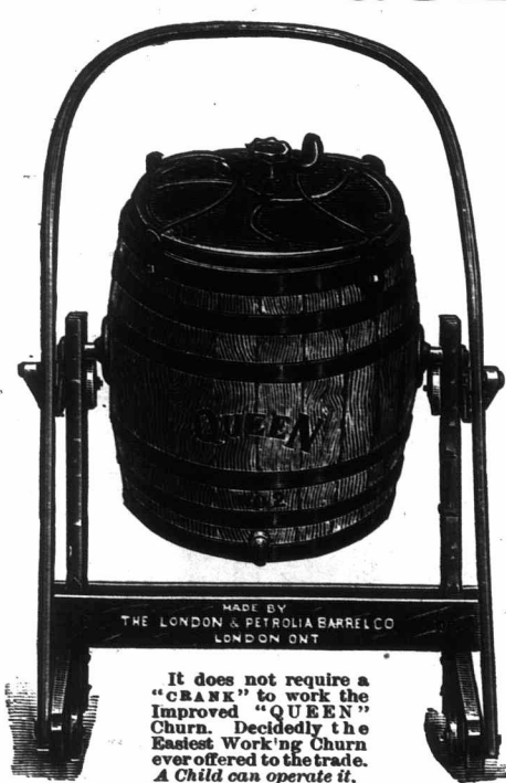
It does not require a "CRANK" to work the Improved "QUEEN" Churn. Decidedly the Easiest Working Churn ever offered to the trade. A Child can operate it.

Road Graders, Rock Crushers, Steam and Horse Road Rollers, Engines, Road Plows, Wheel and Drag Scrapers, Macadam Wagons for spreading Road Material, Elevators and Screens.