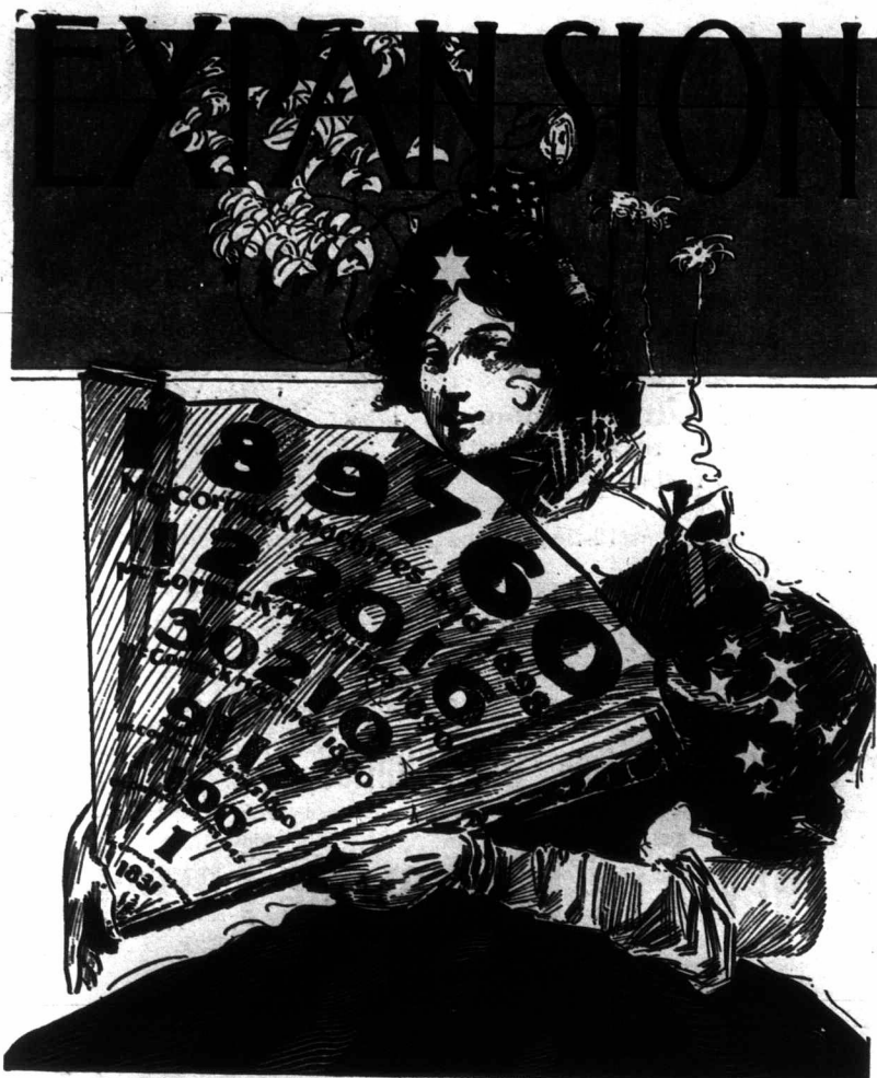
Last season the McCormick Harvesting Machine Company of Chicago built and sold 189,760 machines. This kind of expansion dwarfs every other achievement American history records in favor of the well being of the farmers. Buy McCormick machines and you will get your money's worth.