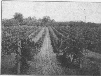
A Canadian Vineyard