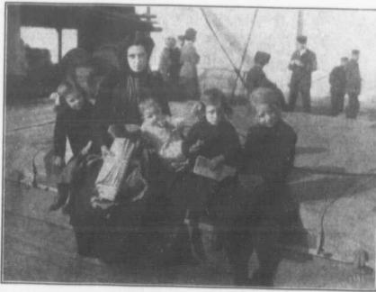
From Bonnie Scotland—Coming to Canada to join Husband and Father who came out a year ago.

The Canada of to-day is a land of Peace and Plenty, a place of Sunshine and Big Crops, a country whose soil spells wheat and out of whose farms thousands are growing rich. Already Canada's per capita wealth is the greatest in the world.