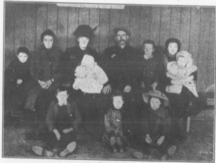
From the overcrowded cities of the Mother-country with their limited opportunities, this family has gone to the broad acres and the golden opportunities of Canada—Britain's Oldest and Nearest Colony.

Free Land in the Western Provinces is Still Offered.