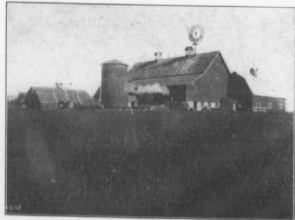
A Comfortable Homestead