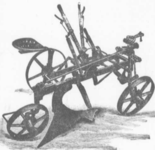
COCKSHUTT BEAVER SULKY

This Beaver Sulky has all the features of the Beaver Gang. The beam for carrying the plow is made of extra heavy high carbon steel, making it a perfect plow for hard work. The wheels are absolutely dust proof, are always under the control of the driver, and are so arranged that the plow will automatically adjust itself to the