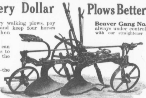
COCKSHUTT BEAVER GANG

And this Gang plow will make better furrows, plow quicker and save you nearly half your plowing expenses, than if you used two ordinary walking plows. Read about the Beaver in our Catalogue.