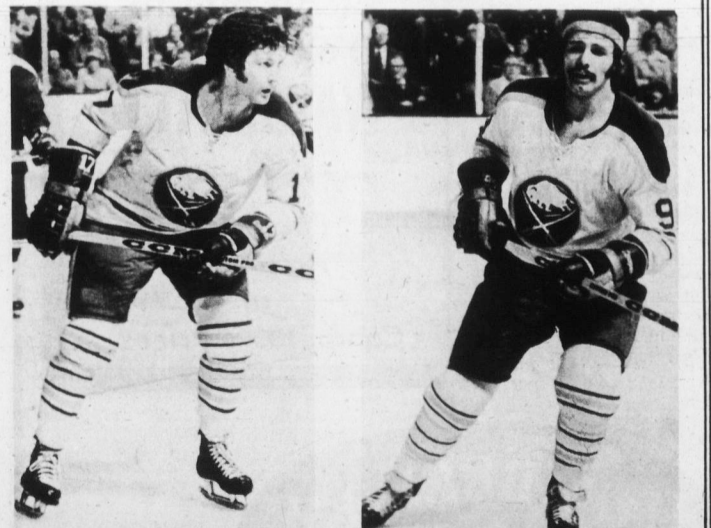
Mississaugan Fred Stanfield is one of two Buffalo Sabres who have slipped champagne from Lord Stanley's mug. The other is Jim Lorentz and both are eager to repeat the honor. They will have to ground the Philadelphia Flyers and Kate Smith first.